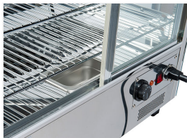
Stainless steel basement