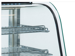
Double glass to reduce dispersion